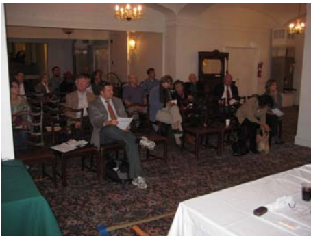
Attendees gather in advance of the annual meeting

should have a standard package of materials to guide member-sellers and real estate agents through the various steps and procedures that will be required in selling a unit and transferring ownership. (3) It is helpful to provide a list of lenders who have Recognition Agreements with the cooperative. (4) Pertinent financial information on the cooperative – e.g., monthly fees, special assessments, underlying mortgages, reserves – should be made available. (5) The cooperative's board of directors needs to process documents, schedule interviews, and act on applications from prospective member owners quickly and expeditiously (and not hold to rigid, inflexible schedules). (6) The real estate agent needs not only to understand how cooperative ownership is generally different from ownership in a condominium, but also to know the various steps and requirements for transfer of ownership in a particular cooperative. (7) It is critical to use a good settlement agent.