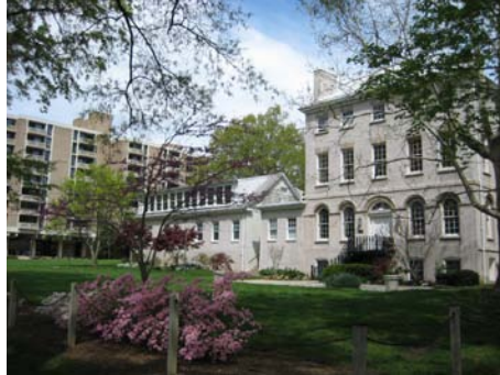
In addition to four major high-rises and modern townhouses, the Tiber Island complex incorporates the historic Law House

include providing low-flow shower heads to residents, composting on the property, using environmentally friendly cleaning products, and installing a solar energy system to generate hot water.