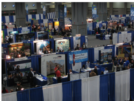
Over 100 exhibitors filled the Convention Center Hall

Thanks to the many Coalition members who stopped by our table. We hope you enjoyed the CAI Conference and Expo (and your free Coalition tote bag)!