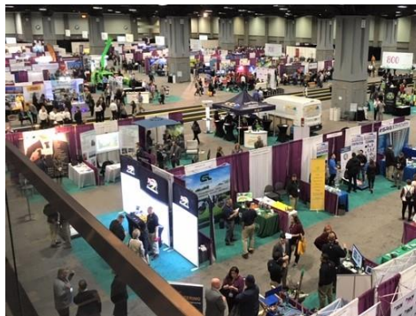
The 2019 Conference & Expo was held at the Walter E. Washington Convention Center on Saturday, February 23.